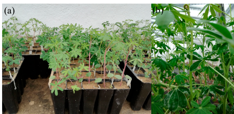
Figure 4. Lupinus mutabilis anthracnose resistance evaluation experiment. (a) plants with anthocyanin pigmentation and (b) without anthocyanin.

first, fourth and fifth rows with anthocyanin pigmentation and the three remaining row without anthocyanin pigmentation.