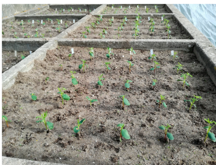
Figure 3. Experiment conducted in vegetation box for identifying Lupinus mutabilis accessions with anthocyanin in their organs. Each accession with 5 plants and 30 by vegetation box. From left to right: